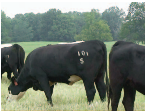
Unique animal identification brand

Plastic ear tags are the most common form of individual animal identification. In 2007, 57.5 percent of U.S. beef cows were identified using plastic ear tags, 20.5 percent with hot iron brands, 9.8 percent with ear notches, 7.7 percent with ear tattoos,