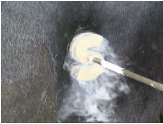
Copper alloy freeze branding iron

Some Mississippi beef cattle operations brand on the shoulder with irons as small as 1½ inches tall.