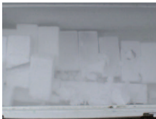
Denatured alcohol and dry ice