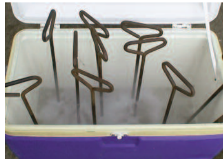
Irons in dry ice and alcohol

Before applying branding irons to the hide surface, make sure that the animal is properly restrained (preferably in a squeeze chute). Clip, clean, and spray the branding area with a layer of denatured alcohol.