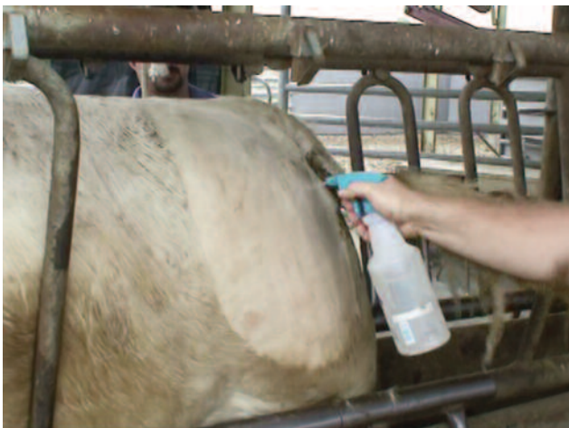
and spraying denatured alcohol on the branding area