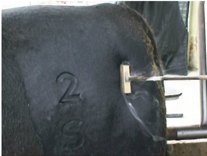
Outline left by freeze branding