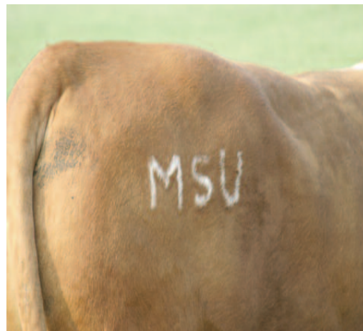
South Farm's ranch holding brand

3.9 percent with freeze brands, and 1.2 percent with electronic ID. The breakdown of calf identification methods was similar with 50.2 percent plastic ear tagged, 12.3 percent Bang's tagged, 11.8 percent hot iron branded, 11.2 percent ear notched, 5.6 percent ear tattooed, 2.9 percent electronically identified, 2.0 percent metal ear tagged, and 1.1 percent freeze branded.