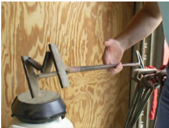
A hot branding iron

Always check the iron and animal information before branding to make sure the correct iron is applied. Begin timing when the iron first contacts the hide. Press the iron face to the hide hard enough to make sure that there is good contact over the entire surface of the iron. The animal may react within the first 10 seconds of brand contact.